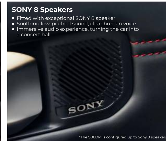
*The S06DM is configured up to Sony 9 speakers