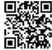
SOUEAST Official Website